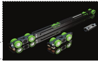
New Hanging System